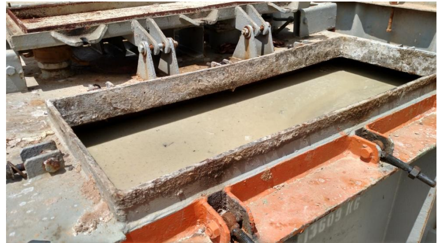
Brine Storage Boxes